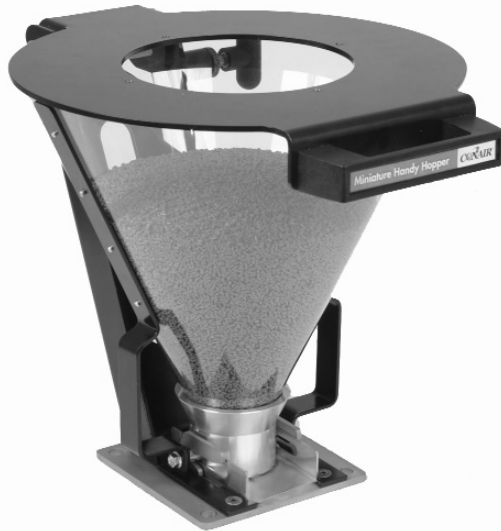
Miniature Handy Hopper

Material changes are fast, clean and simple with this removable polycarbonate hopper on your processing machine. No tools are needed to quickly hinge the hopper lid out of the way and pull the miniature, see-through hopper cone from the compact frame. A dribble-proof slide gate automatically engages as the hopper is removed, allowing remaining material to be returned to the gaylord, bag or barrel. The mini handy hopper is also an ideal supply hopper above additive feeder throats.